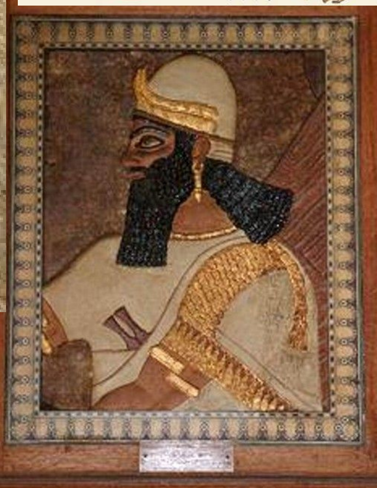
Assyrian Art taken from the ancient capital of Nineveh: brought to Scotland by Schomberg Henry Kerr (9th Marquess of Lothian) Attaché at Tehran in 1854, Baghdad in 1855.